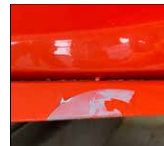
plastic - no adhesion promoter required